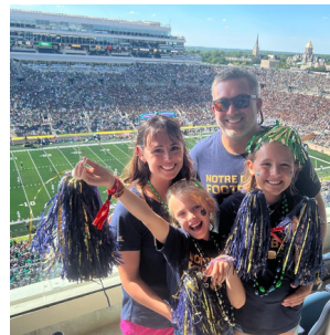
NOTRE DAME BOX SEATS + LODGING